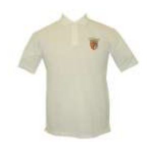
White-Logo Polo Shirt (long/short sleeve)