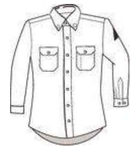
Striped-Logo Oxford Shirt (short/long sleeve)