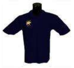
Navy Blue-Logo Polo Shirt (long/short sleeve)